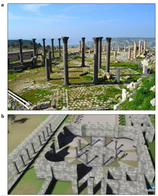
Figure (4) a. view of the octagonal church in its current condition, b. 3D reconstruction of the octagonal church to its state before destruction

is unique in terms of its architectural plan. It was a square with an octagonal interior and a rectangular atrium or colonnaded courtyard. It has a fine opus sectile floor. The early sixth-century octagonal church was formed by re-used basalt col-umns and capitals, the atrium was also formed by re-used limestone columns and capitals. The church was destroyed by earthquakes in the 8th century and the ruins were discov-ered in 1806. Close-range photogrammetry with the point cloud produced by laser scanning enabled the creation of a 3D model of the church showing how it was before the destruction, fig. (4-b).