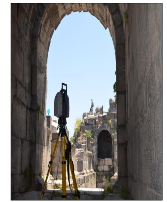
Figure (2) Laser scanner used for collecting 3D clouds of the monuments

The field measurement of the monuments and their adjacent areas was performed with a terrestrial laser scanner (TLS), fig. (2), with which the entire monument was scanned, together with its courtyard.