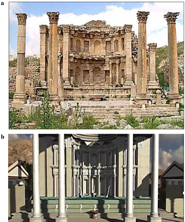
Figure (3) a. the Nymphaeum of Gerasa, b. 3D reconstruction of the Nymphaeum based on archaeological evidence