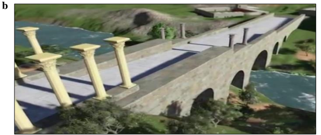
Figure (6) <u>a</u>. the current condition of Gerasa Roman bridge, <u>b</u>. 3D reconstruction of the Roman bridge showing its function.